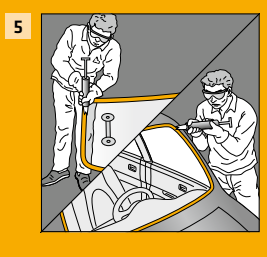
Set the gun at an 80 - 90° angle to the surface. Avoid interruptions.