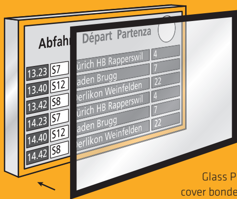
Glass PMMA or PC cover bonded on metal with Sikaflex®-223 .