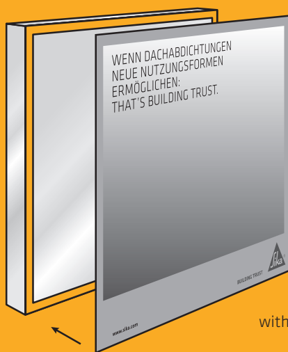
Metal to metal with Sikaflex®-552 AT or Sikaflex®-953 .