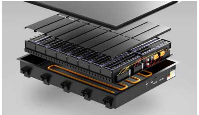
Thermal management for modules with SikaBiresin® TC gap filler

“On-demand” adjustable curing processes add value to conventional assembly processes. Additionally, thanks to low compression force and viscosity, SikaBiresin® TC gap filler allows for easy assembly combining with low abrasion. Moderate adhesion strength also allows for disassembly and serviceability.