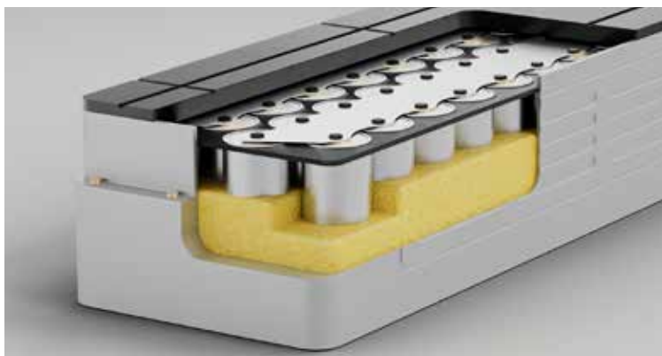
SikaBiresin® TC gap filler for easy assembly and disassembly