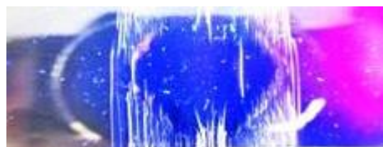
PC Specimen using a standard PUR adhesive