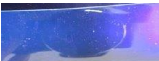
PC specimen using SikaForce®-820 L06